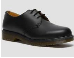
Plain Black School Shoes